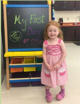
First Day of PreK